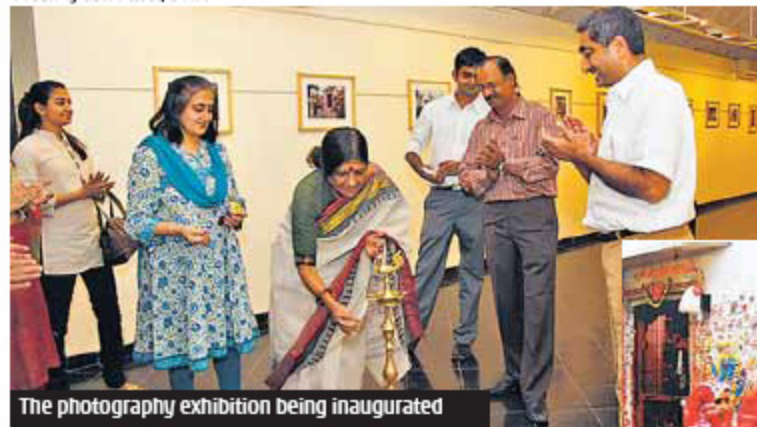
The photography exhibition being inaugurated